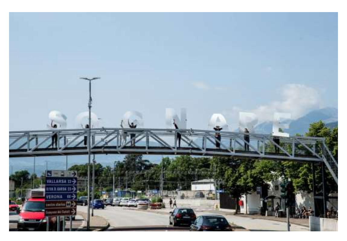
Bridge across the entrance to Rovereto. "The Bridge Dream."