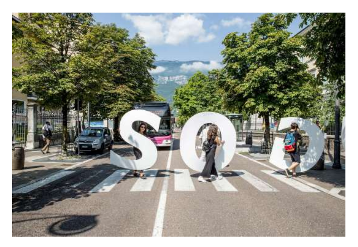
Crossing the street in Rovereto.