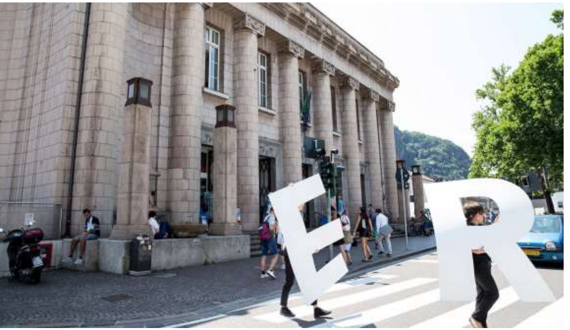
32 ARIAS-MISSON / Dreaming 🛙 33 "The dream marches into Bolzano."