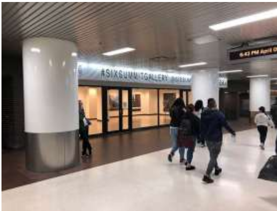
Installation view. Six Summit Gallery, 2nd floor, Port Authority bus terminal, NYC.