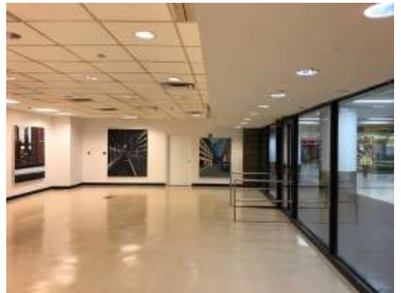
View of passersby in front of gallery.