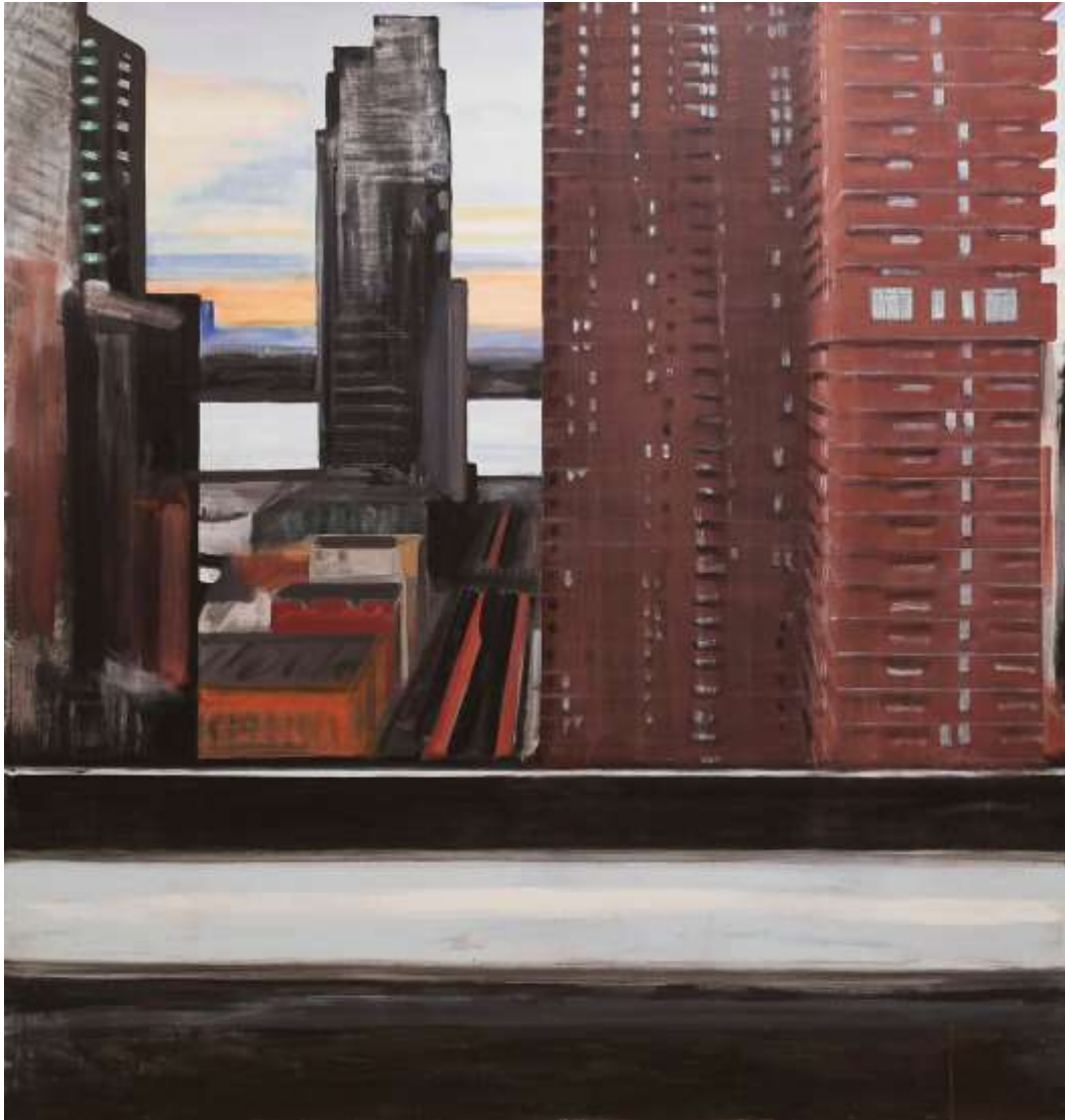
43rd Street looking east. Acrylic on canvas. 72" x 60".