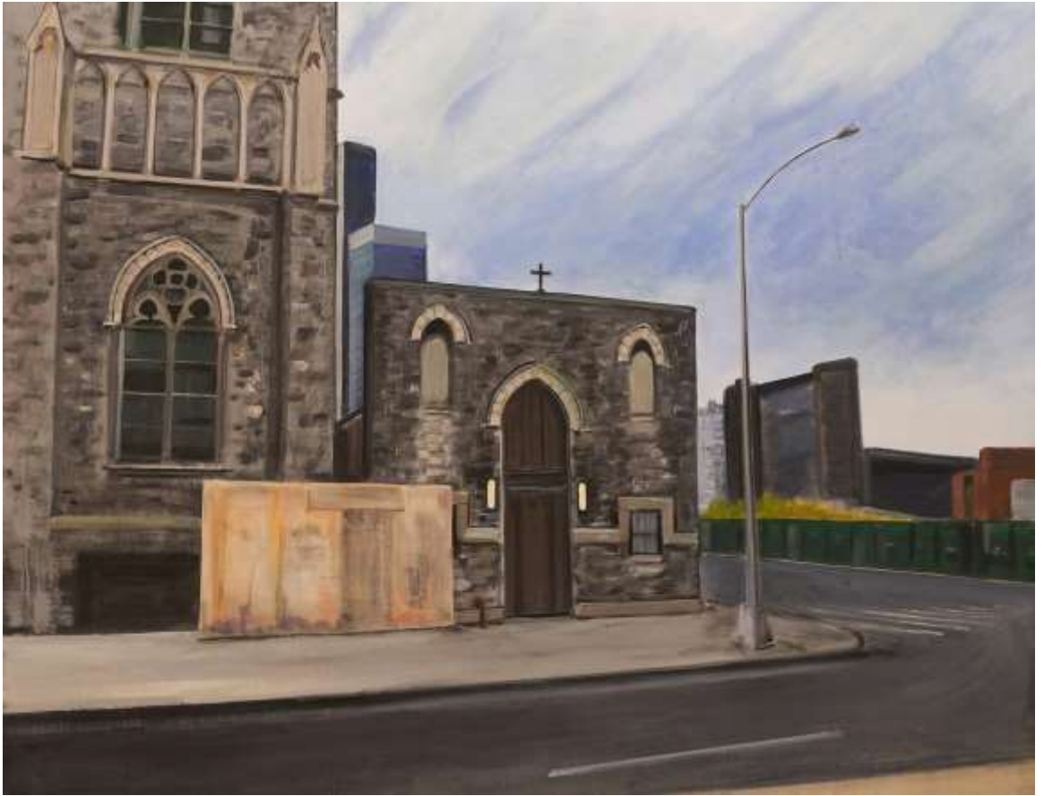
Croatian Church. Oil and acrylic on canvas. 54" x 69".