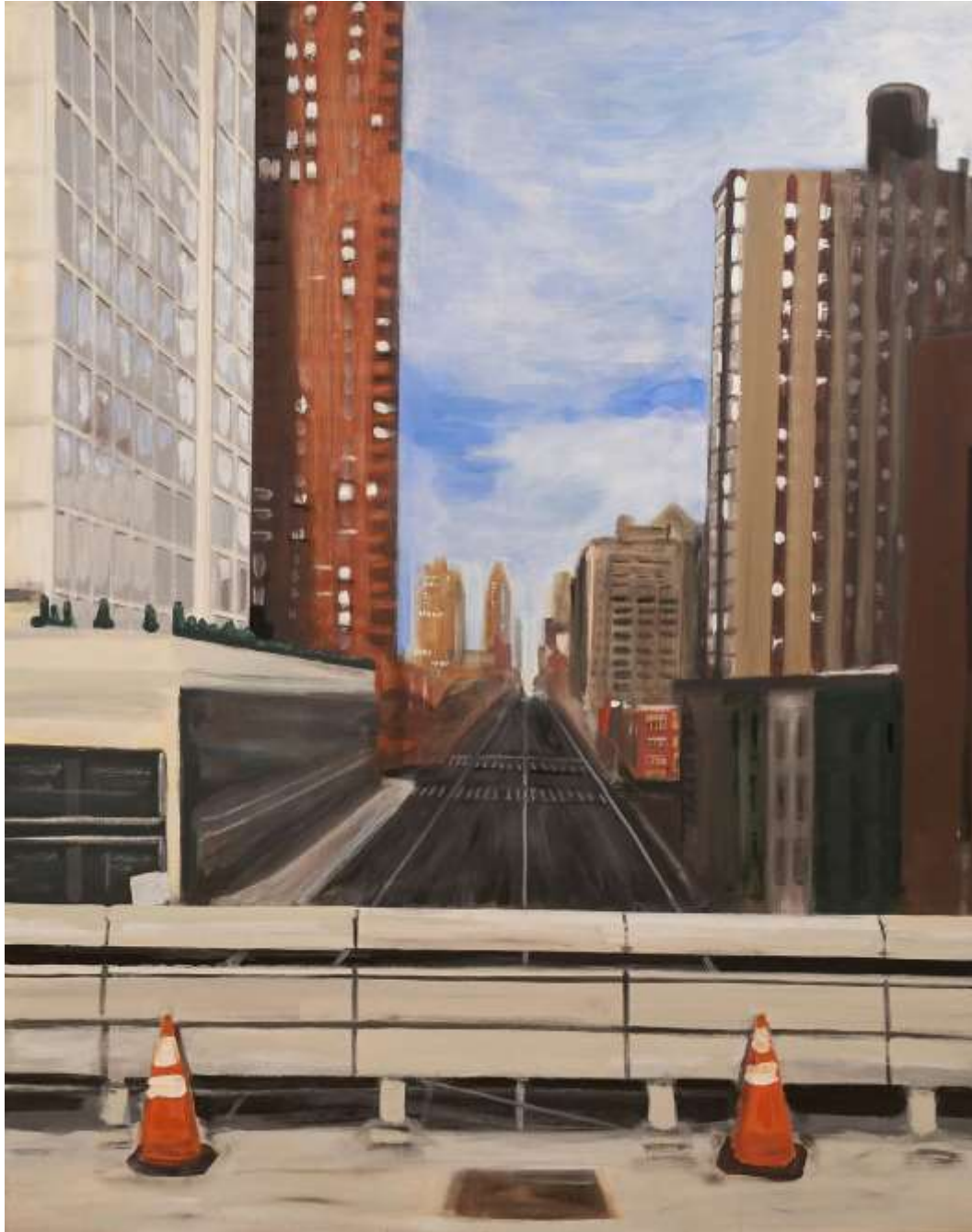
east. Acrylic on canvas. 52" x 66".