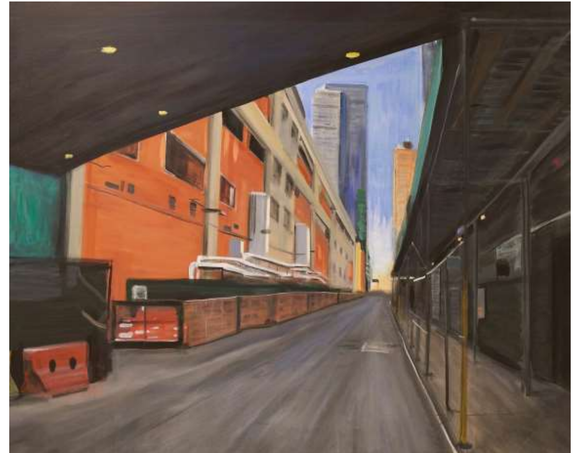
41st Street looking