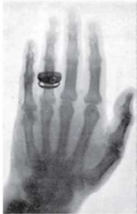
Figure 1. First X-ray picture made in public by Roentgen during his first oral presentation before the Würzburg Physico-Medical Society on 23 January 1896. The picture shows the hand of Albert Kolliker who chaired the talk.

Art von Strahlen (On a New Kind of Rays) which was published in the Proceedings of the Würzburg Physico-Medical Society ( Sitzungber der WürzburgerPhysik.- MedikGesellschaft ). First oral presentation of the discovery was made before the same Würzburg Society on 23 January 1896. The meeting was chaired by the famous anatomist Albert Rudolf von Kolliker (1817–1905) as reported in the Münchener Medicinische Wochenschrift of 29 January 1896. After the lecture Roentgen produced an X-ray picture of Kolliker's hand in a glass plate (Figure 1). It was Dr. Kolliker who proposed that the new rays henceforth be known as Roentgen rays [4].