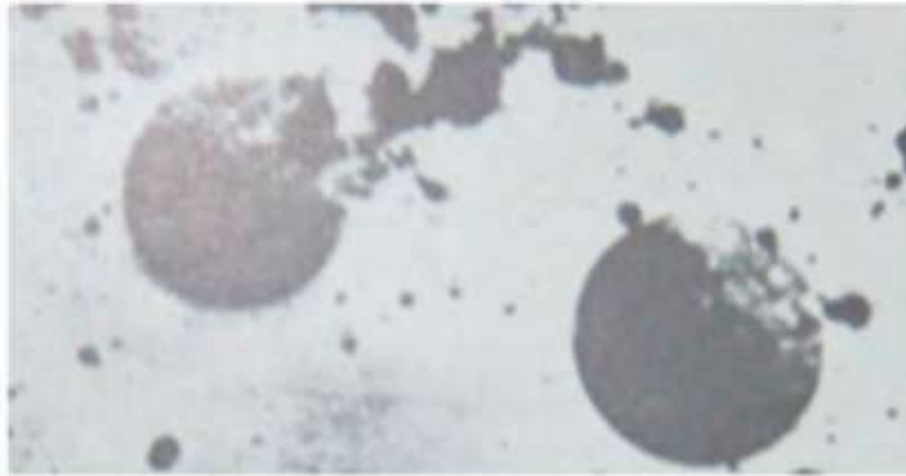
Figure 3. Goodspeed's first shadowgraph produced in the University of Pennsylvania on 20 February 1890. The rounded shadows are coins. (Taken from: The Trail of the Invisible Light ).

The most legitimate claim was that of a Scottish engineer Alan Archibald Campbell Swinton (1863–1930) who tried to replicate X-ray photos in the beginning of 1896 immediately after the discovery [4]. He conducted his experiment using a homemade tube and his plates were first reproduced in Nature and subsequently in Industries and Iron and the Electrical Review of London the next day [11]. From the reconstructed timetable that he maintained, the following were captured: first (poor) roentgenogram on Tuesday January 7; first satisfactory “metallic” (a razor in its paperboard casing) roentgenogram on January 8; first roentgenogram of a hand on January 13 (shown to the Prince of Wales); and first exhibit of those two plates on 16 January 1896.