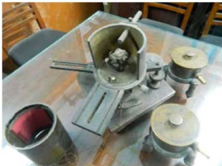
Figure 8. X-ray Diffraction Apparatus built by SN Bose.