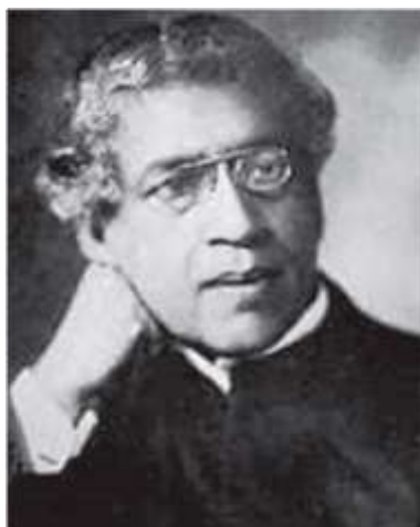
Figure 5. Jagadish Chandra Bose (1858–1937).

Jagadish Chandra Bose returned to India in April 1897 and started building his apparatus [3]. D M Bose, his nephew, and former Director of Bose Institute, remarked in one of his articles that after ‘reading a newspaper account of Roentgen’s discovery’ he built an X-ray apparatus in Presidency College, Calcutta [18].