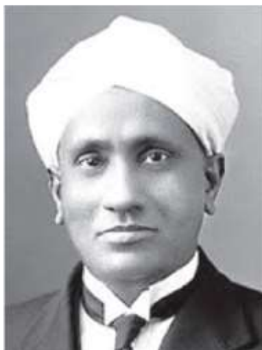
Figure 7. C.V. Raman.

optical theory of scattering to X-ray diffraction by liquids. Experiments were also carried out to compare the theory with experimental results. Sogani [24] recorded the X-ray diffraction patterns of 22 aliphatic and aromatic liquids and estimated the average molecular distance from the position of the maxima of the diffraction haloes. It became clear from these experiments that the shape of the molecules and the intermolecular forces had profound influence on the diffraction patterns. Krishnamurti [25], another student of Raman, initiated small angle X-ray scattering which enabled us to understand the size and distribution of the particles in a sample. This is reportedly the first small angle X-ray scattering experiment performed in India [26].