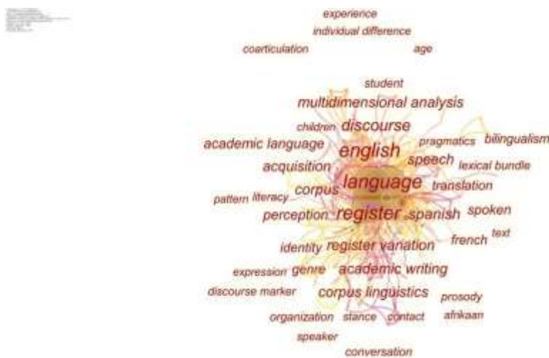
Figure 5 Keyword Co-Occurrence analysis from 2010-2021

The keyword co-occurrence map of international register research (see Figure 5) was drawn by selecting keywords as nodes. As mentioned above, the size of a node reflects the frequency of keywords, and the stronger the betweenness centrality, the more likely it is to appear in the center of the map. At the same time, according to betweenness centrality and keyword frequency, this study also summarizes a list of high-frequency keywords that appeared at least 10 times in foreign language studies in the past decade (see Table 6).