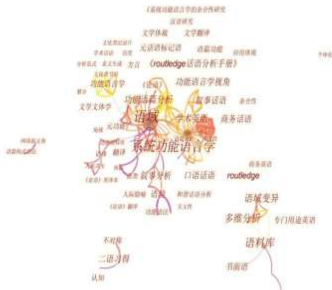
Figure 2 Keyword Co-Occurrence analysis from 2010-2021