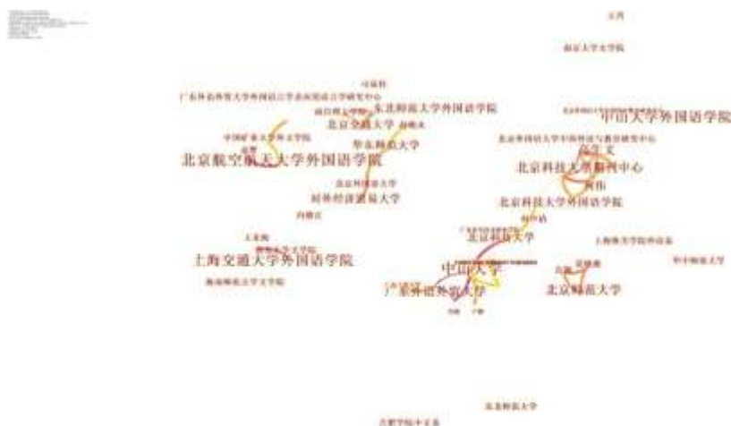
Figure 3 Knowledge map of authors and institutions in Chinese register research

The degree of cooperation between authors in the knowledge map can reflect the cooperation of authors in a certain research field and the research scale, depth and breadth of the theme. Tracking the author groups and cooperative institutions with certain academic influence through CiteSpace will help us better grasp the research trends in a certain discipline field. Therefore, this study selects the author and the institution as the node so as to draw the network knowledge map of authors and cooperative institutions (see Figure 3) and make an overall analysis of it.