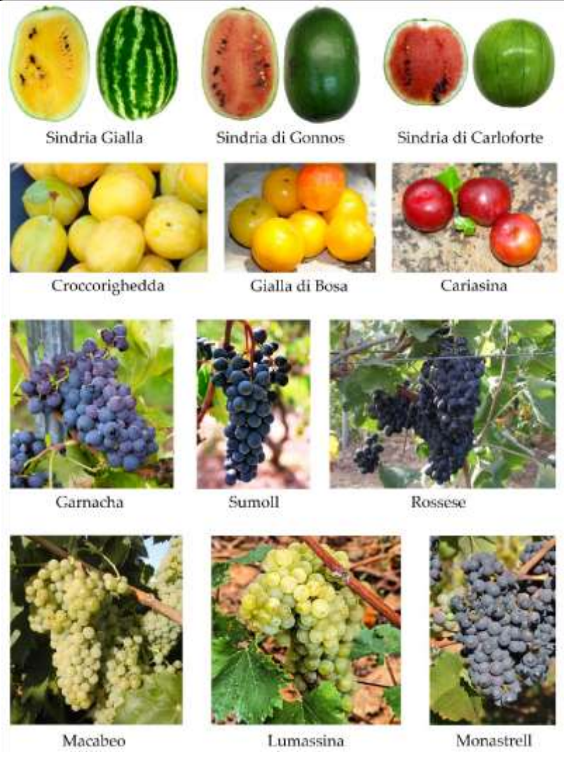
Figure 2. Selected modern cultivars with a close relationship with the archaeobotanical remains found in the Medieval well of Sassari.

The other archaeological samples showed affinity with cultivars from southern Spain (LnES65), Uzbekistan (LnUZ78), Kyrgyzstan (LnKZ81), Algeria (LaDZ59), and Angola (LnAO53) (Table 3, Figure 2).