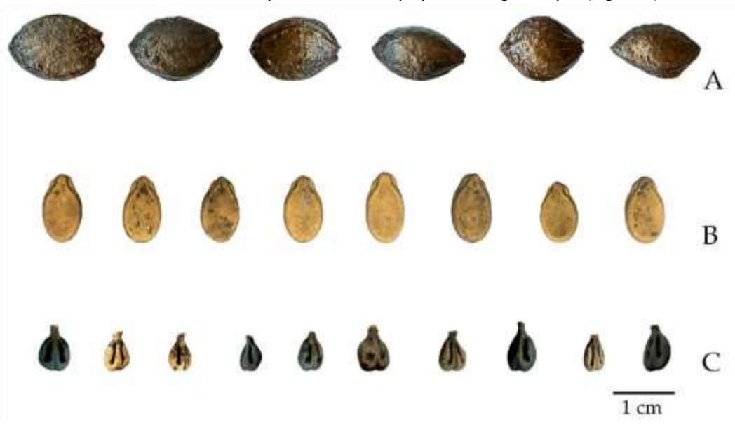
Figure 3. Representative image of some of the archaeological samples used in this work: (A) Prunus domestica ; (B) Citrullus lanatus var. lanatus ; (C) Vitis vinifera subsp. vinifera .

A total of 71 plum fruit stones, 70 watermelon seeds, and 1444 grape pips from the well of Via Satta were analysed for this study by seed image analysis (Figure 3).