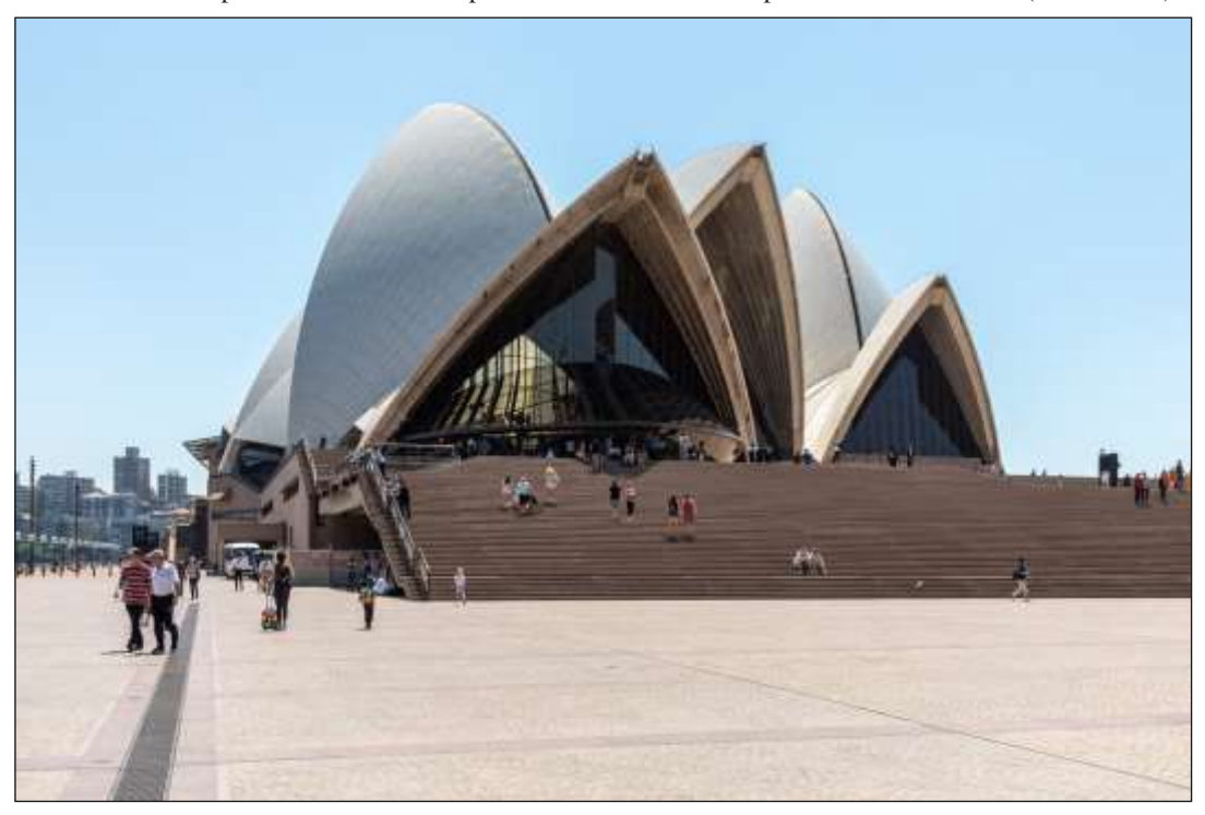
Figure 3: Sydney Opera House: view from southwest. The main halls are reached from the podium stairs, also by way of internal stairs from a porte-cochère directly underneath. Photo by Dietmar Rabich, 1962. Wikimedia Commons, Licence: CC BY-SA 4.0, https://creativecommons.org/licenses/by-sa/4.0/.

The approach of the audience is easy and is distinctly pronounced as in Grecian theatres by uncomplicated staircase-constructions ... The audience is assembled from cars, trains and ferries and led like a festive procession into the respective halls thanks to the pure staircase solution. (Utzon 1957)