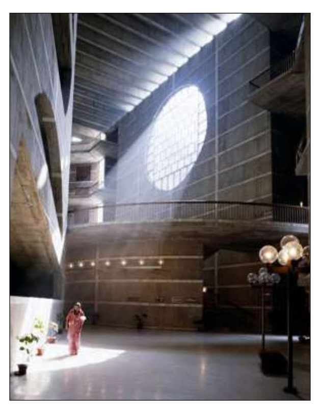
Figure 4: Louis Kahn, Jatiya Sangsad Bhaban (National Parliament House), Dhaka. Interior view. The building accommodates a complex inner community, with a scale and grandeur larger than its individual members.