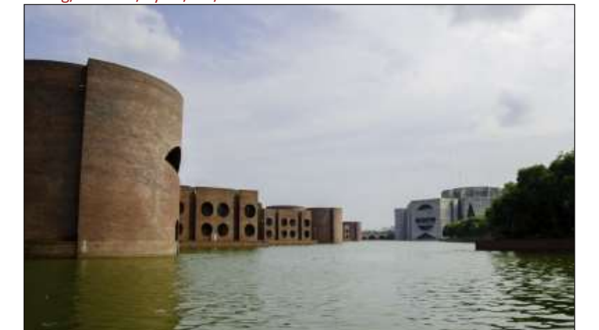
Figure 5: Louis Kahn, Jatiya Sangsad Bhaban (National Parliament House), Dhaka. Exterior view, with lakeside parliamentarians' facilities in brick buildings at left. Photo by Nahid Sultan and Saiful Aopu, 2014. Wikimedia, License: CC BY-SA 3.0, https://creativecommons.org/licenses/by-sa/3.0/ deed.en.

This way of thinking entailed a willed forgetting of precedents, so that the architect might penetrate to the fundamentals: