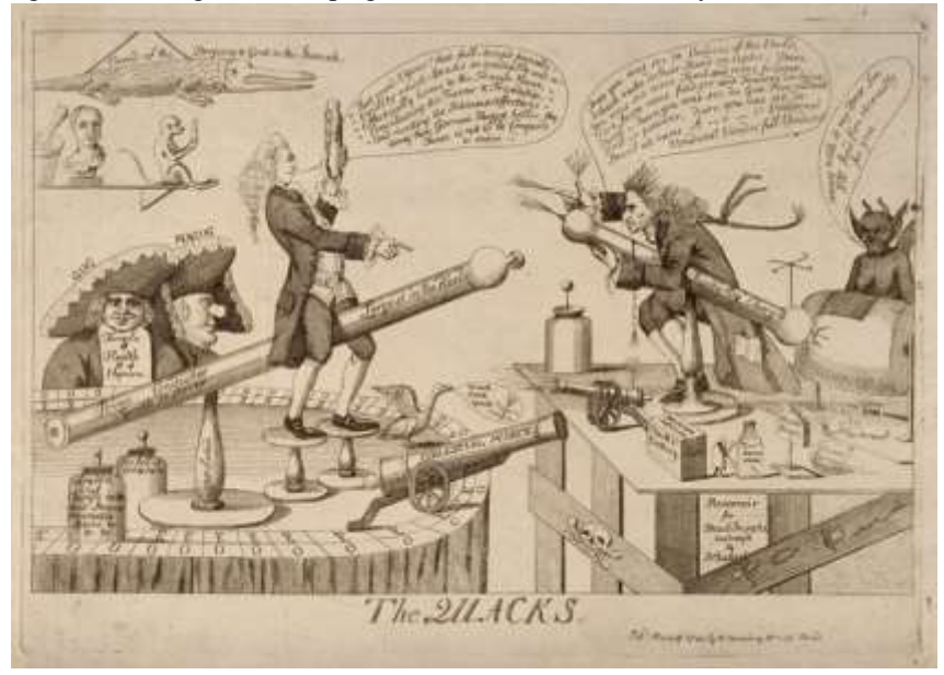
Figure 3. Illustration of Gustavus Katterfelto in battle with James Graham, in British Museum, Catalogue of political and personal satires, V (London, 1935), no. 6325.

'most of them seem to be of opinion, that if these insects should get among the vegetables, it might cause a plague'. He advertised testimony