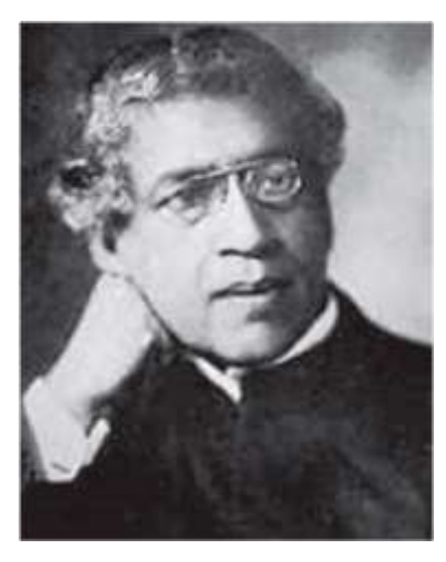
Figure 5. Jagadish Chandra Bose (1858–1937).

Jagadish Chandra Bose returned to India in April 1897 and started building his apparatus [3]. D M Bose, his nephew, and former Director of Bose Institute, remarked in one of his articles that after 'reading a newspaper account of Roentgen's discovery' he built an X-ray apparatus in Presidency College, Calcutta [18].