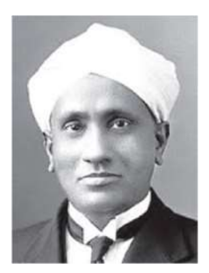
Figure 7. C.V. Raman.

optical theory of scattering to X-ray diffraction by liquids. Experiments were also carried out to compare the theory with experimental results. Sogani [24] recorded the X-ray diffraction patterns of 22 aliphatic and aromatic liquids and estimated the average molecular distance from the position of the maxima of the diffraction haloes. It became clear from these experiments that the shape of the molecules and the intermolecular forces had profound influence on the diffraction patterns. Krishnamurti [25], another student of Raman, initiated small angle X-ray scattering which enabled us to understand the size and distribution of the particles in a sample. This is reportedly the first small angle X-ray scattering experiment performed in India [26].